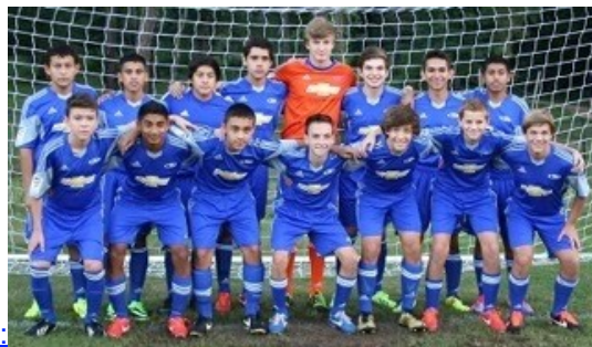
United States Soccer Development Academy (USSDA):