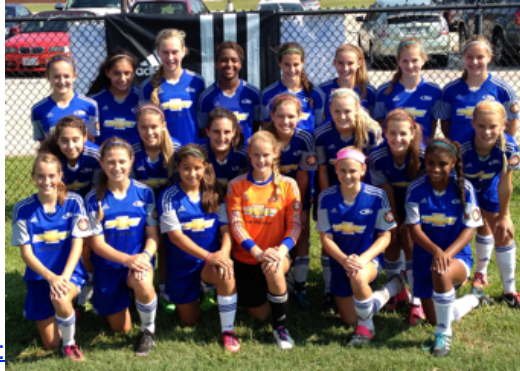
Elite Clubs National League (ECNL):